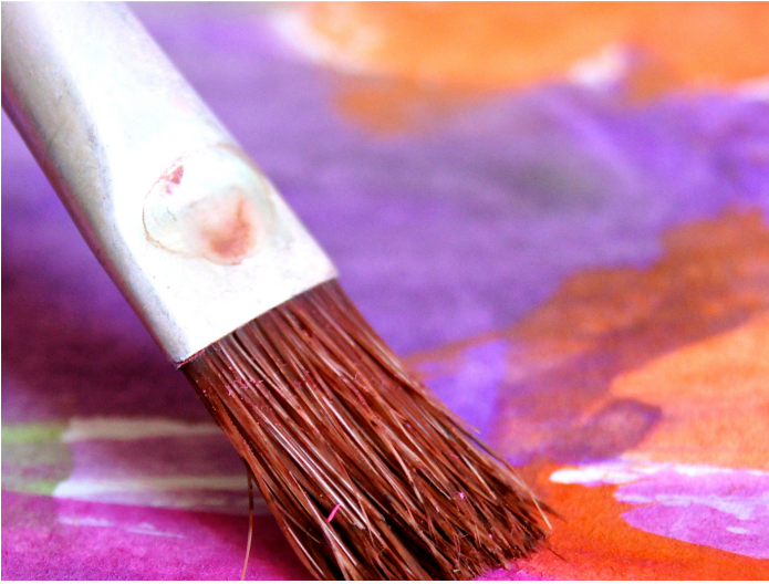
paintbrush on pink canvass