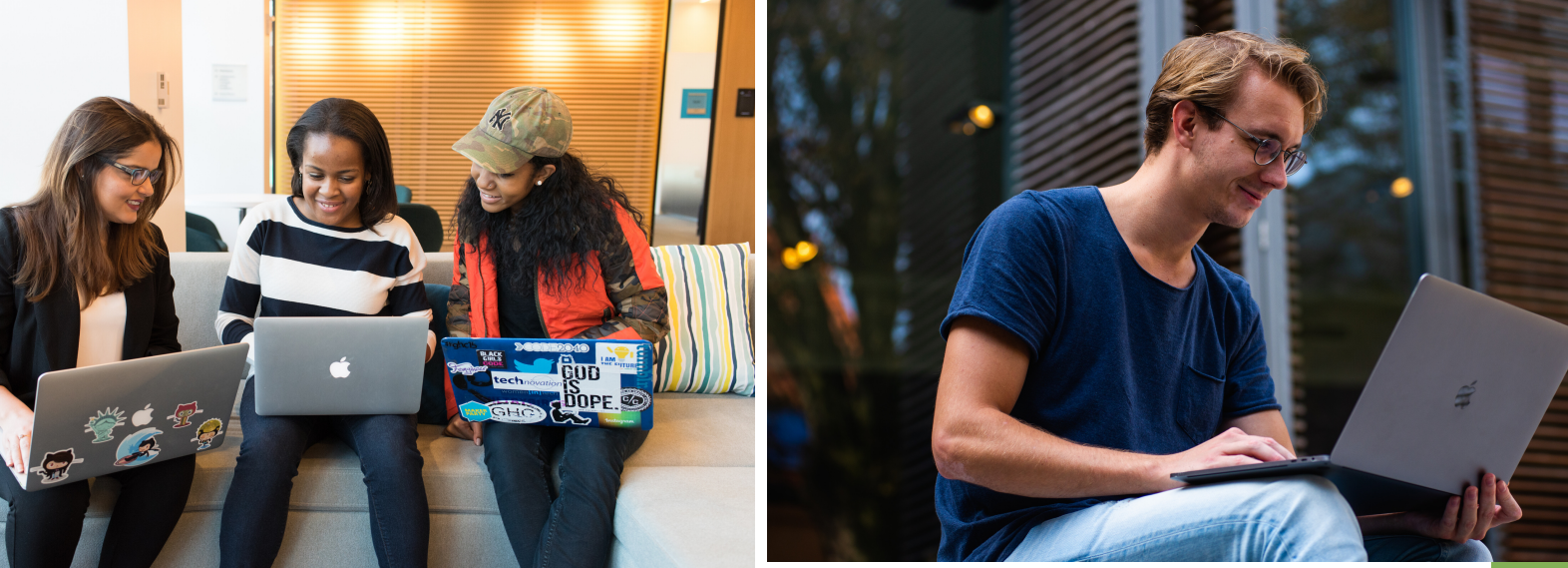
Three students sitting on a couch with laptops open

Our office is built on a holistic, embodied, and student-centered co-curricular approach. Our work with students is aimed to promote self-advocacy, identity development, and sustainable life skills. We promote universal design across campus, and are committed to eliminating barriers both in and out of the classroom/studio environment.