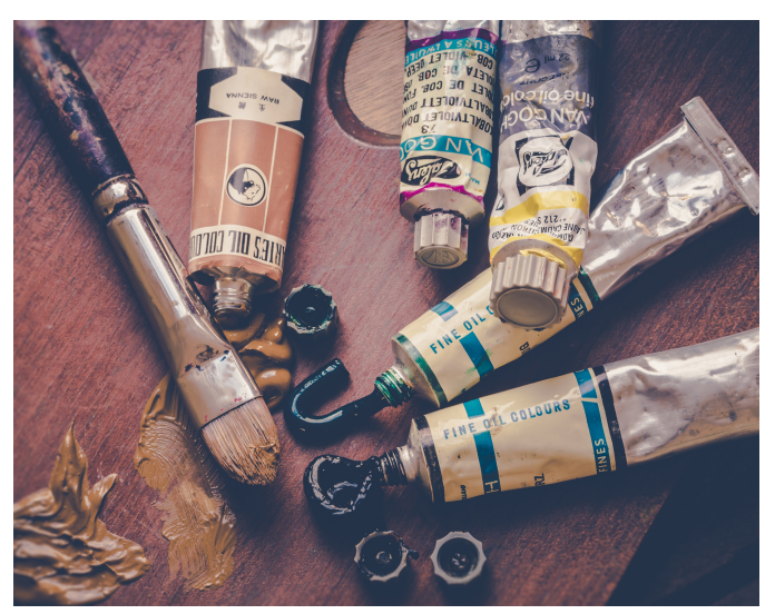
Paints and paint brush on a wooden table